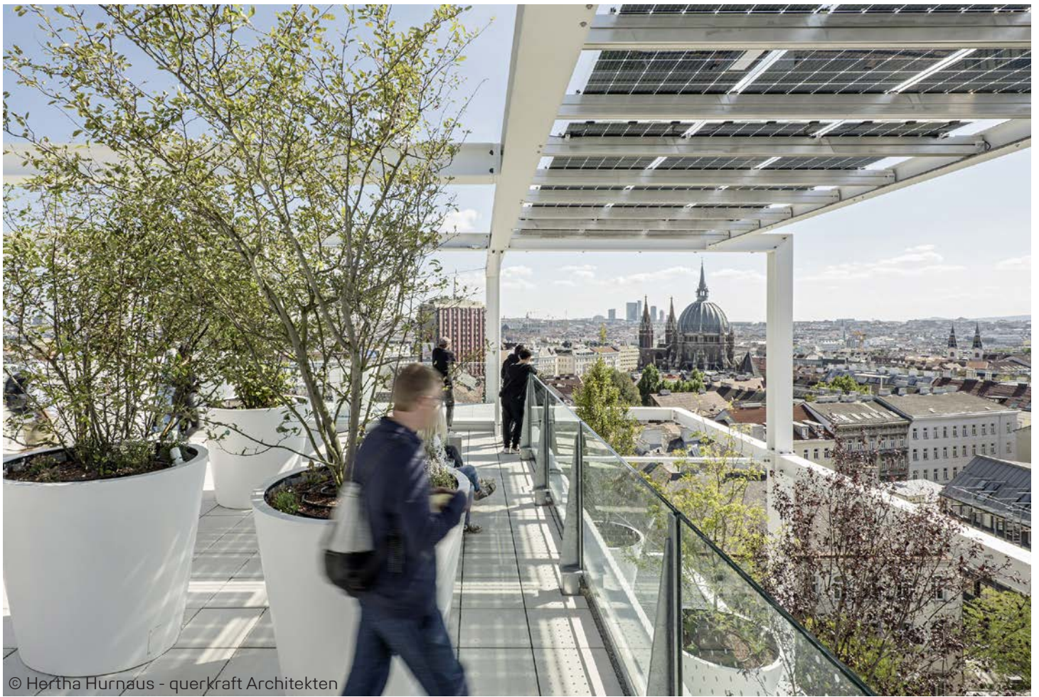
© Hertha Hurnaus - querkraft Architekten